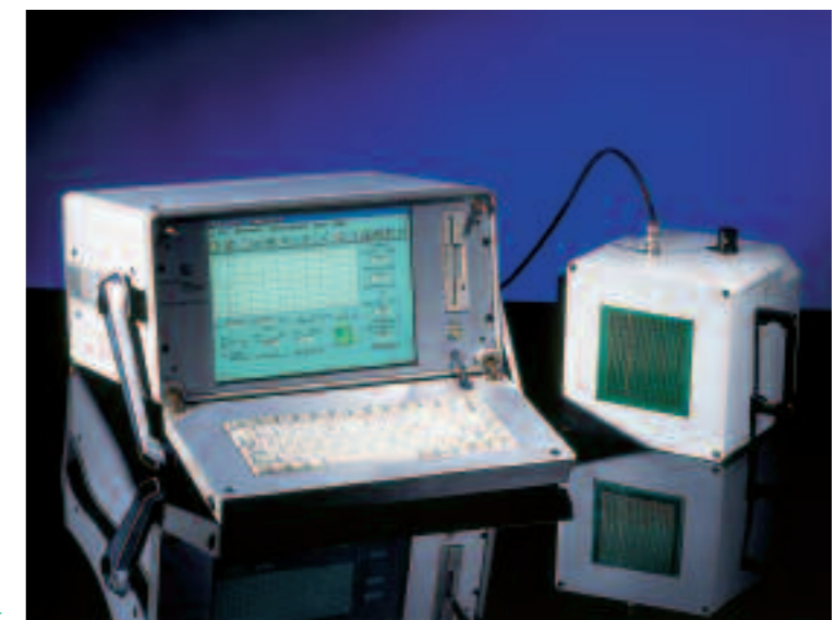
Testing device NMR-INSPECT