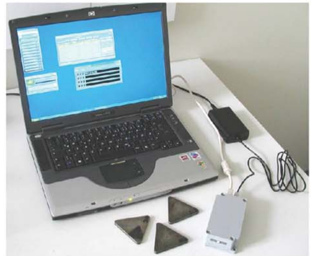
Fig. 1 Mobile Testing Unit